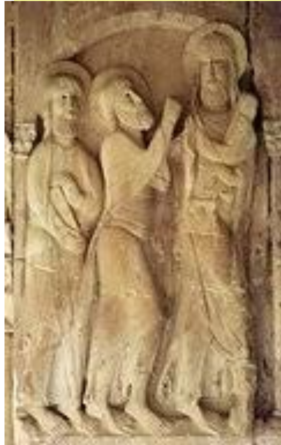
Christ and the Pilgrims of Emmaus Medieval Spanish School

In addition, the Pamphalon Foundation, which supported our children and youth program last year, has made a contribution of $10,000.