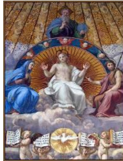
Raphael: The Most Holy Trinity, with God Father, Christ between the Virgin and St. John the Baptist and the Holy Spirit in the centre